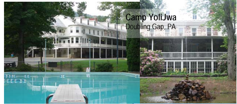
Camp YoliJwa Doubling Gap, PA

Mission week is not your typical week of camp - it is an opportunity to reach out to others and be involved in hands-on ministry.