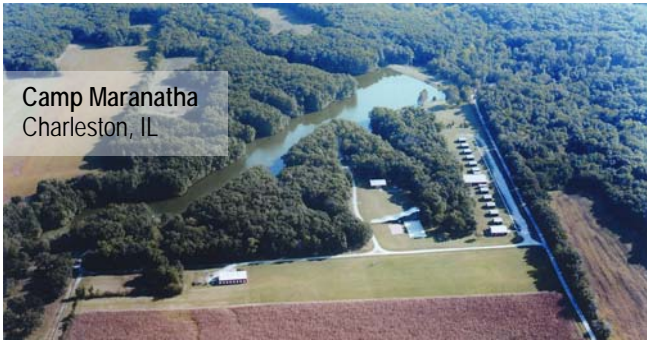
Camp Maranatha Charleston, IL

Also being offered for groups, the camp would like to invite the rental of their facilities for a week of camp or church renewal. There are 12 camper sites with water & electric hook ups that can be utilized by those who like to camp. There is a minimal fee for those who would like to bring their camper in for a few days or a week and relax by our 12 acre lake.