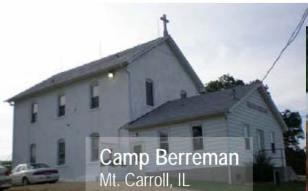
Camp Berreman Mt. Carroll, IL