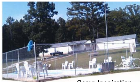
Camp Inspiration Potosi, MO