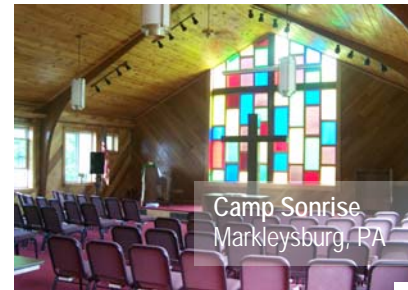
Camp Sunrise Markleysburg, PA

To better assist the growing needs of the camp, this year a Capital Campaign will be launched to raise funds for a new commercial kitchen and apartment that needed replaced along with eight individual mountainous retreat and wilderness camp cabins overlooking Lake Henrietta. Within three years, the camp hopes to raise enough funds to reach this dream.